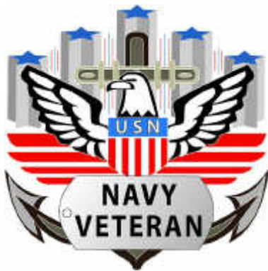
New NAVY VETERAN emblem

We will never forget those on this list who have touched our lives, but let us also not forget these words from The Letter of James in the New Testament, Chapter 1, verse 27: "Religion that is pure and undefiled before God, the Father, is this to visit orphans and widows in their affliction, and to keep oneself unstained from the world." Few survivors may need material help, but some do; all grieve and it is our responsibility to comfort them. Look at the list and call or drop a line to those who have survived but are now grieving alone . Render assistance to those who need more than words. Remember that we are God's hands, feet, and voice; He has delegated this responsibility to us and it makes Him smile when we help others.